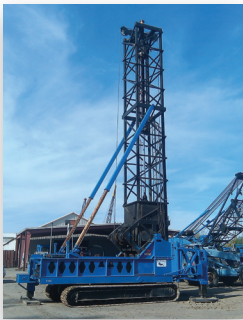
Foundation Pile's Rapid Load Tester

Foundation Constructors Inc. specializes in pile-driving. In other words, we hammer long cylinders made of steel and concrete into the ground. Piles create stable foundations for buildings, bridges, and other structures by distributing the load to the earth around them. Particularly in earthquake country such as Northern California, where we're located, it's critical that piles are properly installed and compliant with rigid standards, to ensure solid, lasting foundations.