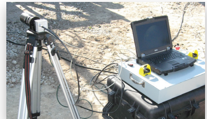
Close up of the RLT computer and camera setup